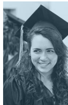
Average cost of attending UAS in Juneau for one year. Includes tuition, student fees, books, and supplies in 2016.